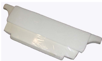
REAR SEAT FOAM SET MGB GT