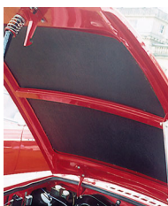
BONNET SOUND PROOFING SET MGB