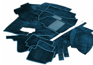
CLUB CARPET SET MGB ROADSTER