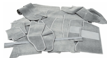
CLUB CARPET SET MGB GT