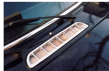
STAINLESS AIR GRILLE MESH MGB