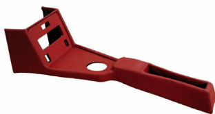
LEATHER CONSOLE WITH LEATHER PANELS MGB