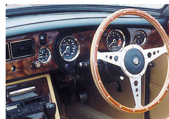
WALNUT DASH MGB, MGC & V8