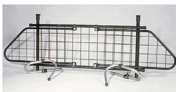
DOG GUARD MGB GT, MGC GT & MGB GT V8