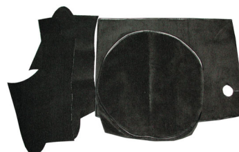
STANDARD BOOT CARPET SET MGB GT