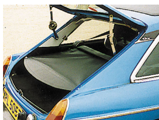
LOAD COVER KIT MGB GT, MGC GT & MGB GT V8