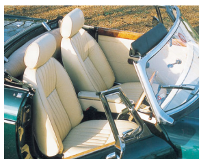
CLUB CLASSIC SPORTS RECLINING SEATS