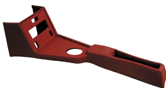
LEATHER CONSOLE WITH LEATHER PANELS