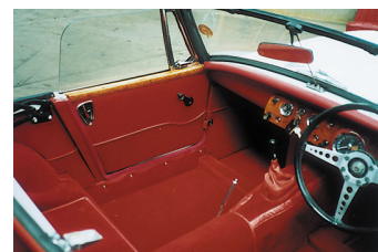
CLUB CARPET SET MIDGET & SPRITE