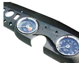
CARBON FIBRE DASH MIDGET