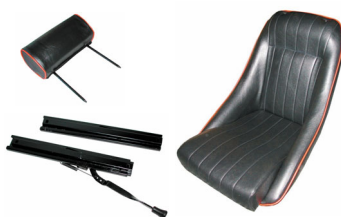
BLACK VINYL BUCKET SEAT