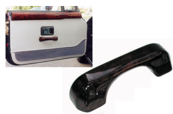
WALNUT DOOR PULLS MGB 1971-80 (PAIR)